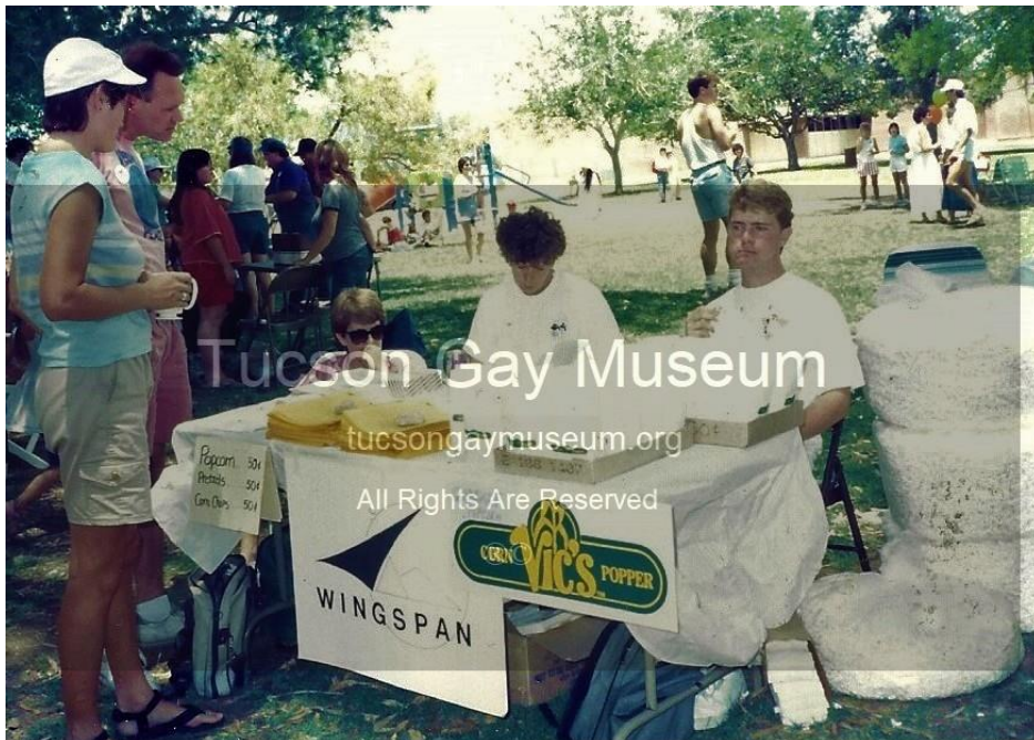
1988 Wingspan table at Pride Picnic sells popcorn, corn chips, pretzels [*]

1988 mid-June – Wingspan Community Center effort sets up card table selling ‘Vic’s Gourmet Popcorn’, Pretzels, and Corn Chips’ at the 1988 Tucson Pride Picnic raising funds for the new group. [Note photo below] [*]