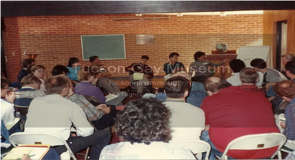
1988 First Community Meeting Does Tucson Need To Try A Gay Community Center Again? [*]

1988 early-February 'First Meeting' – Representatives from some of Tucson's Gay & Lesbian businesses and organizations along with a few members of the 'Community' attend the first of two February discussion meetings held considering creation of another [3] [4] "Lesbian & Gay Resource Center."